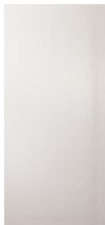
Primed White Flush

For a streamlined, contemporary feeling.