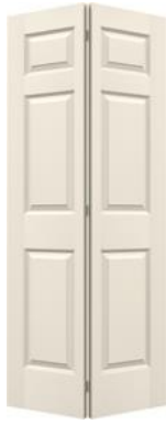
Colonist Textured Bi-Fold