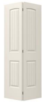
Sante Fe Bi-Fold