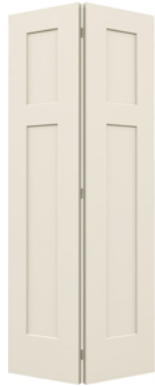
Craftsman III Bi-Fold