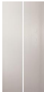
Primed White Flush Bi-Fold