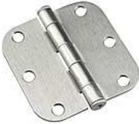
Satin Nickel (standard)