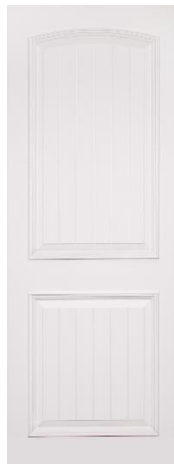
Executive Sante Fe